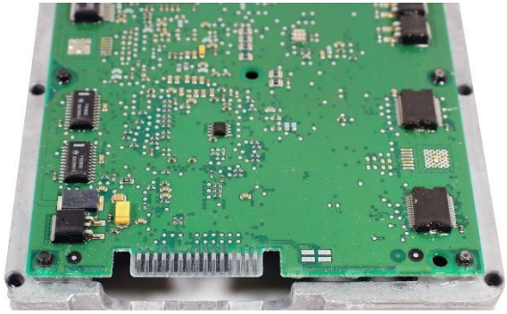
Figure 3 - Cleaned J3 Port

6. Once you have removed all clear lacquer, use some 600 grit sandpaper and lightly scuff the terminals, no more than 3 or 4 scuffs . Do not keep sanding , or you will remove the protective silver coloured solder. Finally, give the terminals a clean with some methylated sprits or isopropyl alcohol.