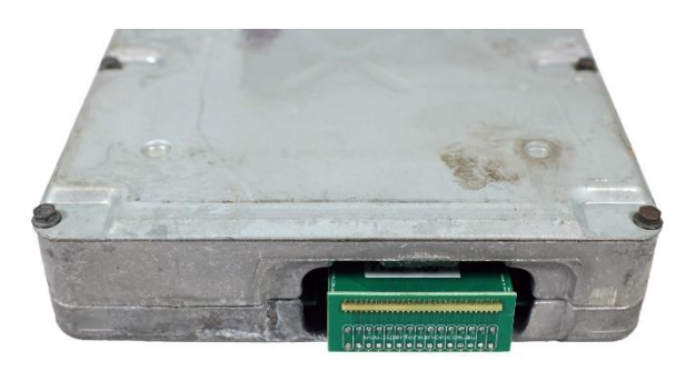
Figure 5 Installing the chip

Tip: Use the Zoom function to see these photos more clearly.