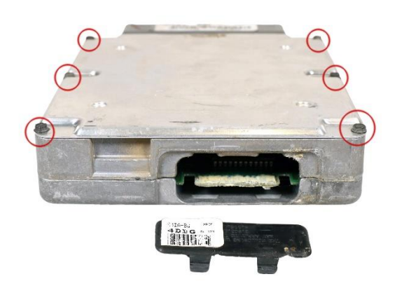
Figure 1 - ECU with cap removed